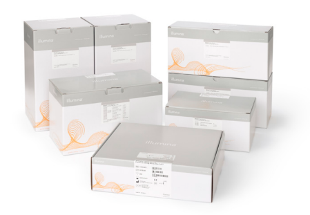
Figure 1: MiSeqDx Cystic Fibrosis Clinical Sequencing Assay. The MiSeqDx Cystic Fibrosis Clinical Sequencing Assay is the first FDA-cleared NGS test to provide a comprehensive view of the CFTR gene.

To overcome this challenge, Illumina offers the MiSeqDx Cystic Fibrosis Clinical Sequencing Assay (Figure 1), the first FDA-cleared in vitro diagnostic (IVD) next-generation sequencing (NGS) test for obtaining a comprehensive view of the CFTR gene.