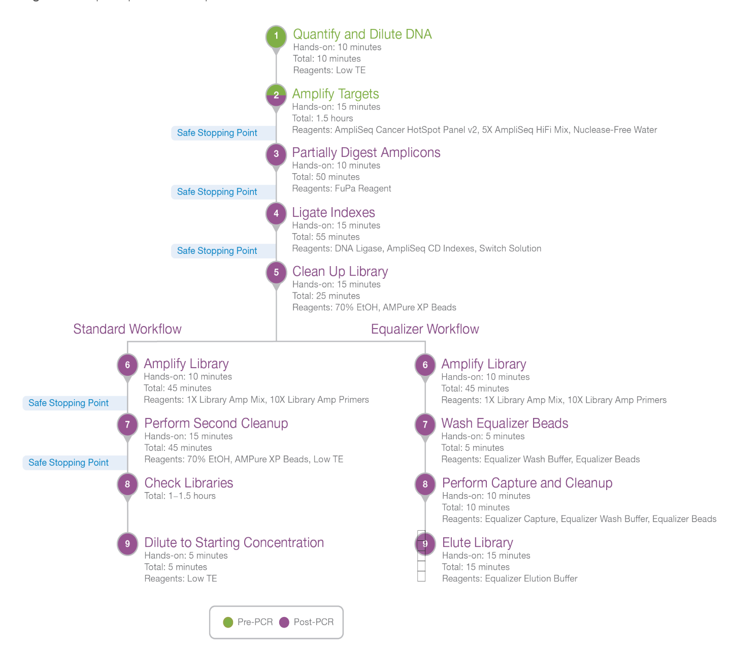
Figure 1 AmpliSeq Cancer HotSpot Panel v2 Workflow

The following diagram illustrates the AmpliSeq for Illumina Cancer HotSpot Panel v2 workflow. Safe stopping points are marked between steps.