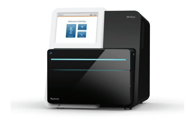
Figure 1: The MiniSeq System—By harnessing advances in SBS chemistry and simple, streamlined workflows, the MiniSeq System delivers a powerful, easy-to-use, library-to-results solution.

The MiniSeq System (Figure 1) delivers the quality and reliability of Illumina next-generation sequencing (NGS) technology in a powerful, accessible benchtop sequencer with a small footprint. This small, robust system turns a broad range of NGS methods into approachable, easy-touse research tools, enabling researchers to take control of their sequencing projects. With the MiniSeq System, there is no need to wait to batch samples for sequencing on a high-throughput instrument; researchers can sequence on demand. It circumvents the iterative, time-consuming testing of Sanger sequencing and qPCR to allow for interrogation of individual genes to entire pathways with full-gene coverage. Laboratories of any size can perform a range of sequencing methods to deliver results and advance their research.