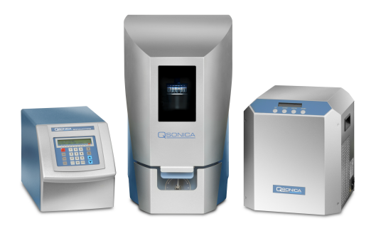
Figure 1: The Q800R2 Sonicator—The Q800R2 Sonicator (Qsonica LLC) demonstrates excellent DNA fragment size control and reproducibility for Illumina library preparation kits.

<sup>†</sup>While the Qsonica method is a successful, demonstrated protocol for Illumina library sonication, it is not an Illumina supported protocol. For support-related questions, contact Qsonica at www.sonicator.com/contact.shtml.