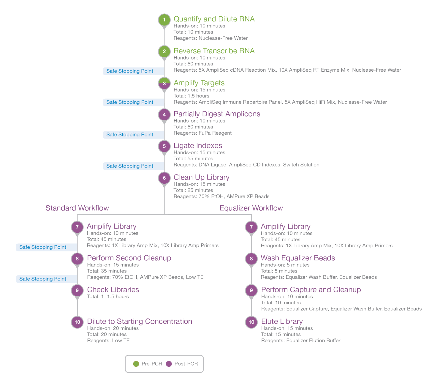
Figure 1 AmpliSeq Immune Repertoire Panel Workflow

The following diagram illustrates the AmpliSeq for Illumina Immune Repertoire Panel workflow. Safe stopping points are marked between steps.