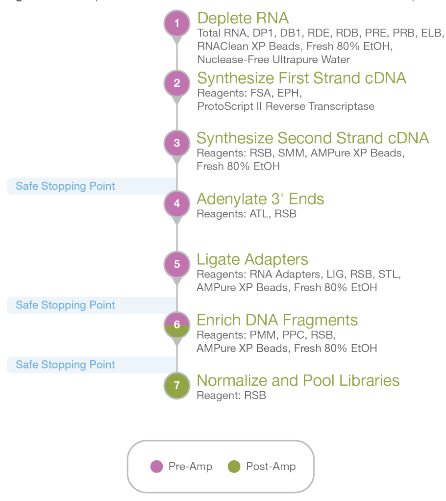
Figure 2 TruSeq Stranded Total RNA With Illumina Ribo-Zero Plus rRNA Depletion Workflow

The following diagram illustrates the TruSeq Stranded Total RNA With Illumina Ribo-Zero Plus rRNA Depletion workflow. Safe stopping points are marked between steps.