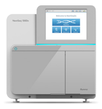
Figure 2: The NextSeg 550Dx Instrument—The NextSeg 550Dx Instrument delivers high-quality results for both clinical and research applications.

The NextSeq 550Dx Instrument is a powerful benchtop sequencing system built to meet the needs of the clinical laboratory (Figure 2). The NextSeq 550Dx Instrument is an FDA-regulated and CE-marked in vitro diagnostic (IVD) system that enables diagnostic laboratories to develop and perform NGS IVD assays ranging from targeted panels to whole exomes. The NextSeg 550Dx Instrument includes dual-boot functionality that includes a diagnostic mode, or Dx Mode, and a Research Mode. These dual modes provide the flexibility to perform IVD testing, labdeveloped test (LDT) development, and clinical research on a single instrument.