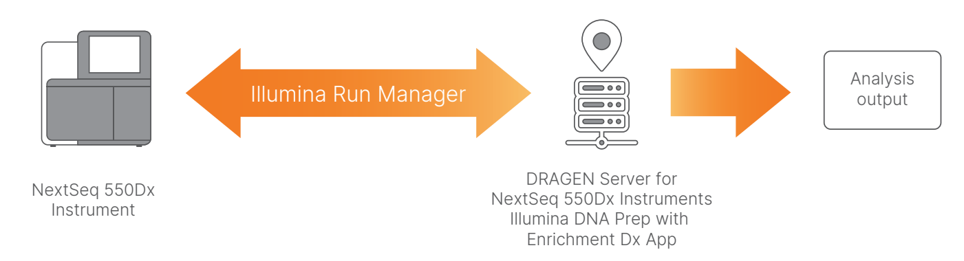
Figure 3: Illumina Run Manager on DRAGEN Server for NextSeq 550Dx Instruments—Illumina Run Manager provides intuitive run setup and automatically initiates secondary data analysis using the application selected during the run setup.

The highly configurable field-programmable gate array technology (FPGA) used for DRAGEN applications also allows for ultraefficient hardware-accelerated implementations of genomic analysis algorithms, such as base call (BCL) file conversion, mapping, alignment, sorting, duplicate marking, and haplotype variant calling.