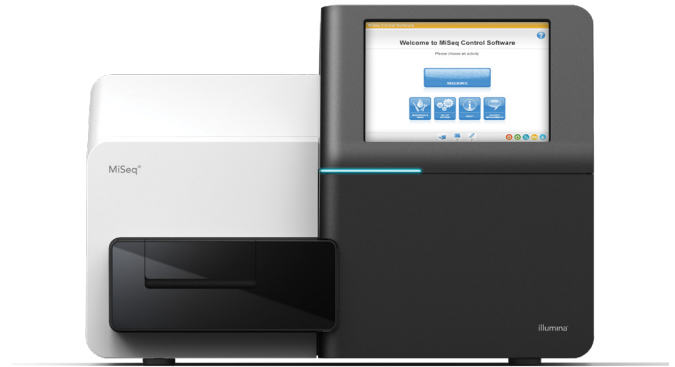
Figure 1: MiSeq System—The compact MiSeq System is well suited for rapid, cost-effective next-generation sequencing.

The MiSeq System offers the first DNA-to-data sequencing platform integrating cluster generation, amplification, sequencing, and data analysis into a single instrument. Its small footprint—approximately two square feet—fits easily into virtually any laboratory environment (Figure 1). The MiSeq System leverages Illumina sequencing by synthesis (SBS) chemistry, a proven next-generation sequencing (NGS) technology cited in over 300,000 peer-reviewed publications—5× more than all other NGS technologies combined. 1 With the power of NGS delivered in a compact footprint, the MiSeq System is the ideal platform for rapid and cost-effective genetic analysis.